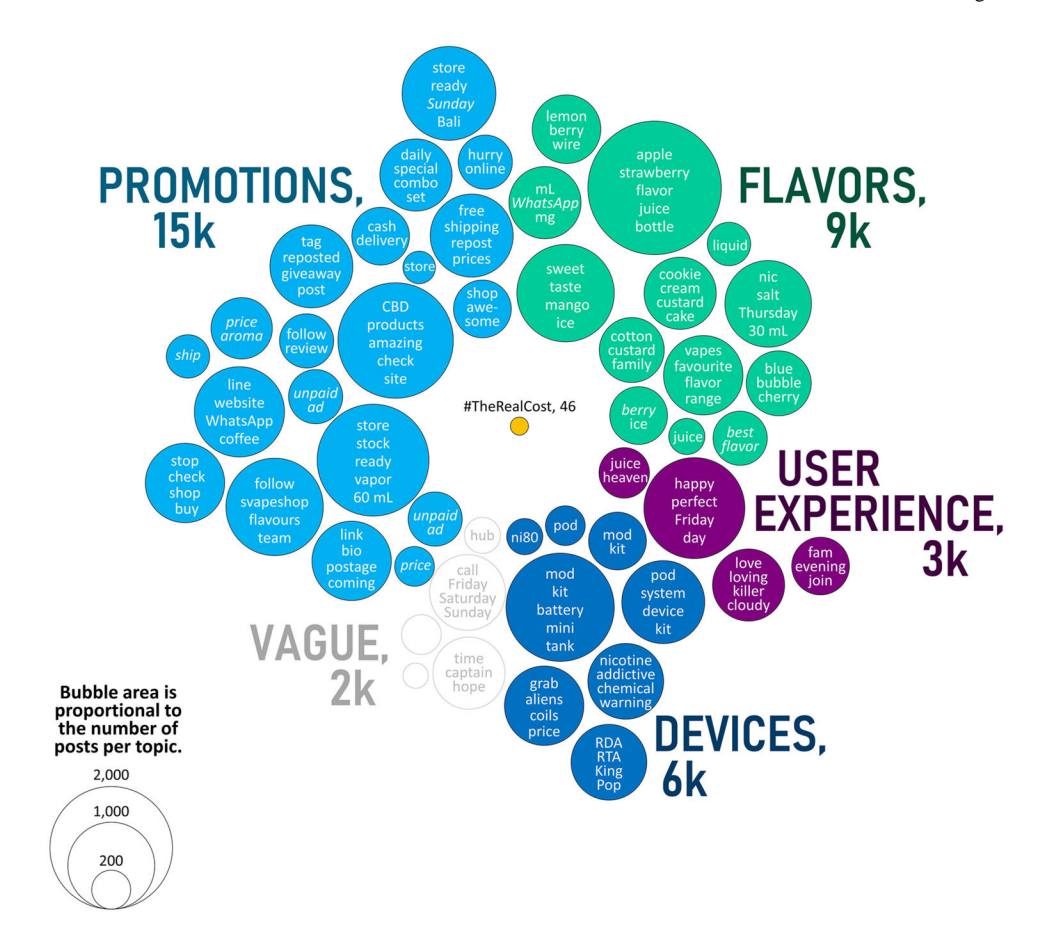
FIGURE 3 I.

The number of Instagram posts from the March 2019 sampling period belonging to each topic as defined by latent Dirichlet allocation analysis of caption text. Here, topics are further organized into informal themes based on the five most-commonly used words from each topic (representative words are displayed). For comparison, only 46 posts in this sample used the hashtag #TheRealCost. Words shown in italic font were translated to English from the original caption text composed in another language (i.e., from Spanish, German, French, Italian, Malay, or Indonesian).